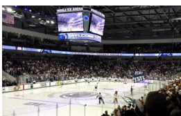
Pegula Ice Arena

Rec Hall is home to Penn State men's & women's gymnastics, men's wrestling, and men's & women's volleyball. There are also extensive fitness facilities, two gymnasiums, racquetball/squash courts, an indoor track, aerobics room and adaptive weight room on site. www.athletics.psu.edu/rec/rechall