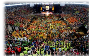
THON February 2017

The Penn State IFC/Panhellenic Dance Marathon , better known as THON , is the largest student-run philanthropy in the world. It benefits the Four Diamonds Fund at Penn State Hershey Children's Hospital, which helps the fight against pediatric cancer. Each February, people fill the Bryce Jordan Center to watch students dance without sitting or sleeping for 46 hours. www.thon.org