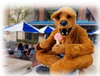
The Berkey Creamery

The Logan Valley Mall is located in Altoona, PA and features over 120 stores on two levels. www.shoploganvalleymall.com