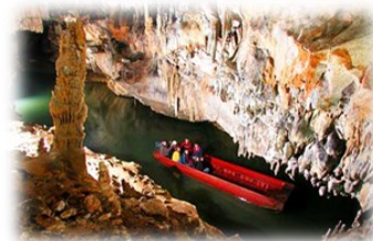
Penn's Cave & Wildlife Park

Penn's Cave & Wildlife Park is nestled in Centre Hall, PA and earned a place on The National Register of Historic Places. Penn's Cave is America's only all-water cavern that you are able to tour by boat. The Wildlife Tour is given by bus and explores 1,500 acres of preserved natural habitat for birds and animals. www.pennscave.com