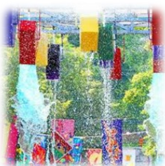
Arts Fest July 14-17, 2016

Central Pennsylvania Festival of the Arts is better known as Arts Fest and is held each July in downtown State College. Over the course of four days, the Streets are lined with hundreds of art vendors ranging from sculptures and wood working to photography and jewelry. Past entertainment has included singing and musical performances, dancers, films, sidewalk art, and even sand sculpting. www.arts-festival.com