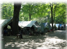
Grange Fair August 19-27, 2016

Central Pennsylvania 4 th Fest is a daylong Fourth of July celebration held on the east campus of Penn State. Events include the Parade of Heroes, Firecracker 4K Race, music performances and a spectacular firework display choreographed to music. www.4thfest.org/