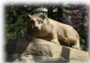
The Nittany Lion Shrine

Bald Eagle State Park spans 5,900 acres in Howard, PA and offers a wide variety of landscapes, such as forests, fields, and wetlands. The park is open year round for hiking, boating, swimming, fishing, ice fishing, ice skating, camping, and picnicking. www.dcnr.state.pa.us/stateparks/findapark/baldeagle/index.htm