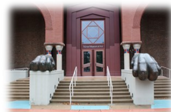
Palmer Museum of Art

The Palmer Museum of Art resides on the Penn State campus and admission is free. It offers 11 galleries, a print-study room, and an outdoor sculpture garden. www.palermuseum.psu.edu